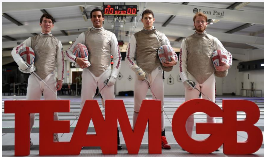
The GB Men's Foil Team for Rio 2016