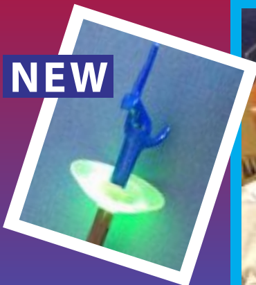
Guard light sensor foil with pistol grip