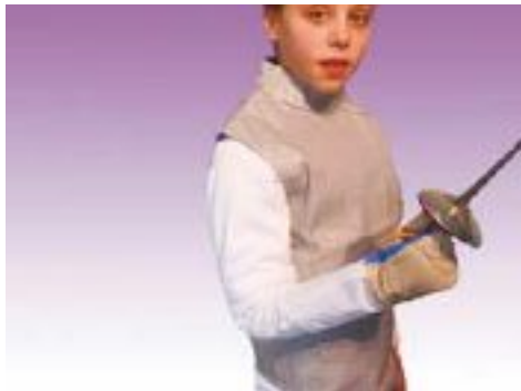
Foil Lamé £54.99