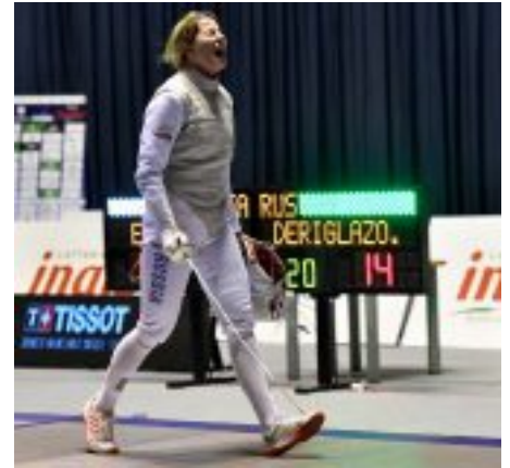
Deriglazova scores the winning hit in the semi-finals at the Turin GP