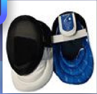
Standard club foil electric mask