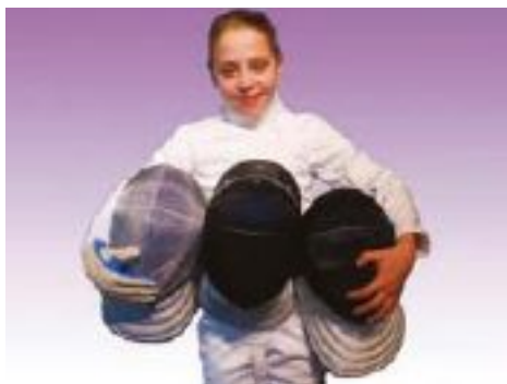
Masks: epee £45.99, foil £51.99, sabre £51.99