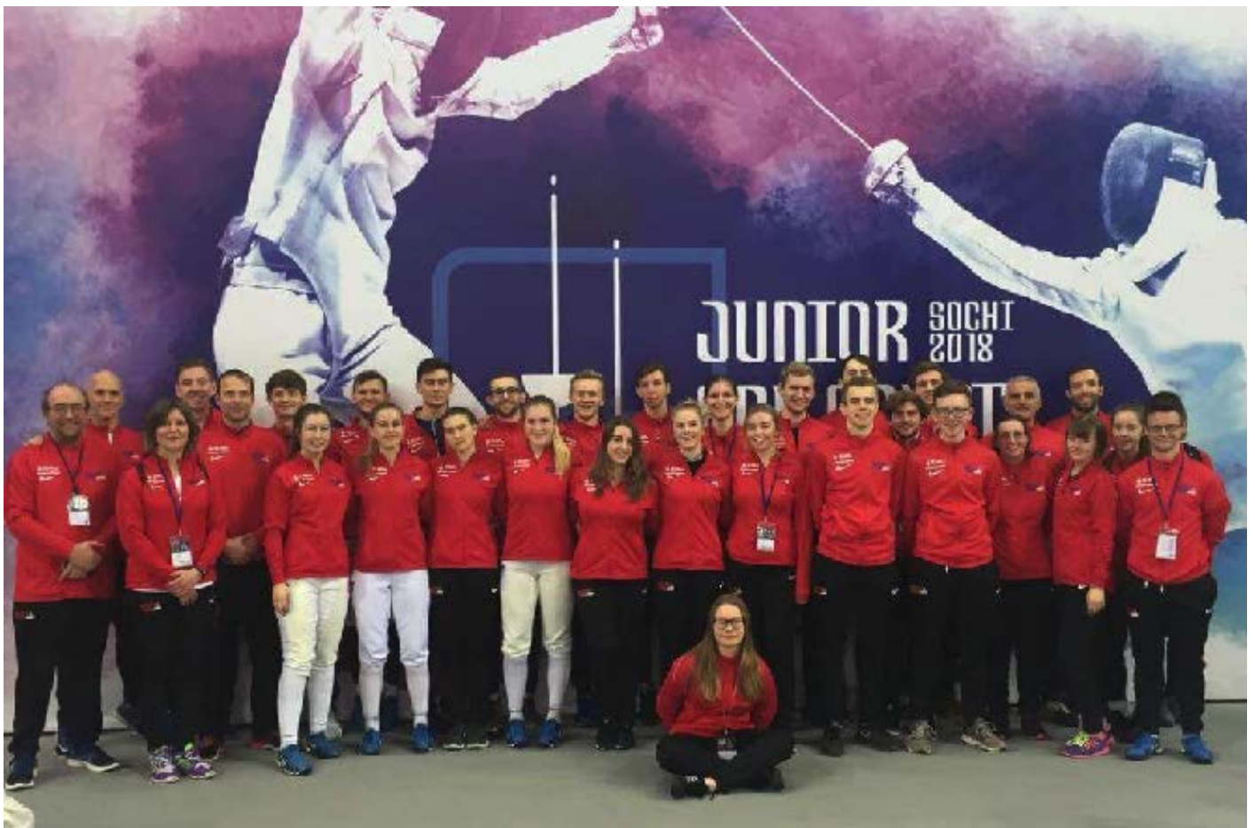
GBR Junior Euros Team

A video playlist of the action from day 10 is available here .