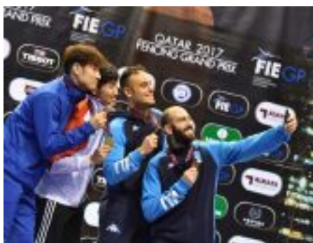
Men's Podium Selfie at the Doha Grand Prix