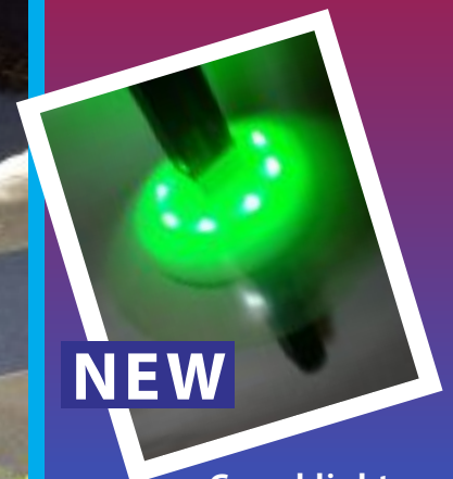
Guard light acoustic foil