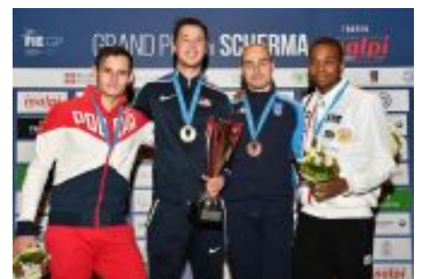
Turin GP 2017 Men's Podium

team event as they fell to the USA in the gold medal match. France dominated Korea in the third-place play-off to claim bronze.