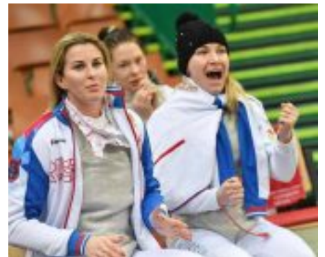
Russia Claim Katowice Team Gold