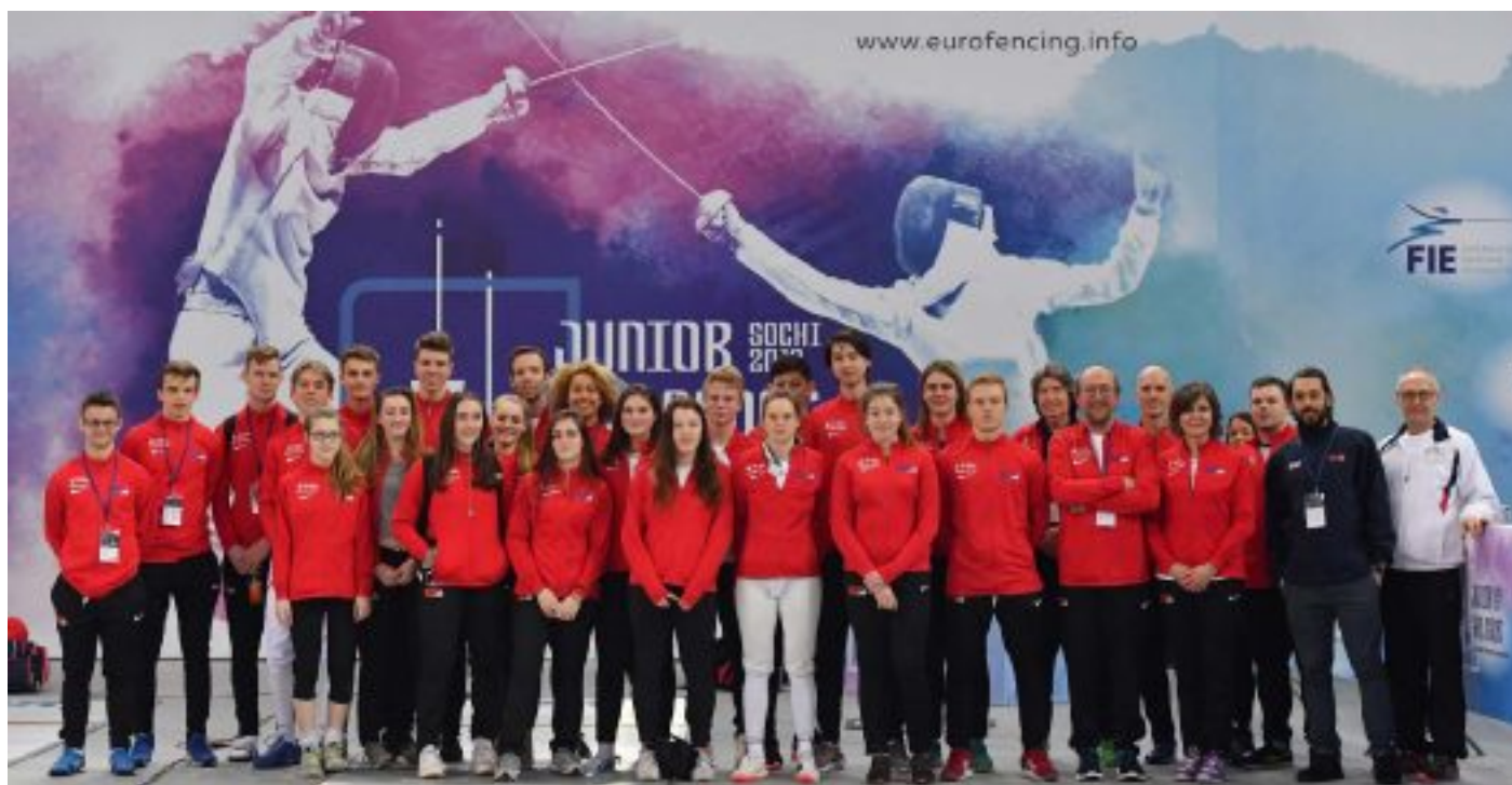
GBR Cadet Euros Team