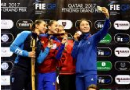
Doha GP 2017 Women's Podium