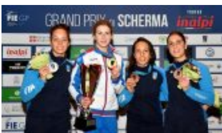
Turin Women's Foil Grand Prix 2017 Podium

Italy dominated the podium at the women's event at the Turin Grand Prix but it was Russia's reigning Olympic Champion, Inna