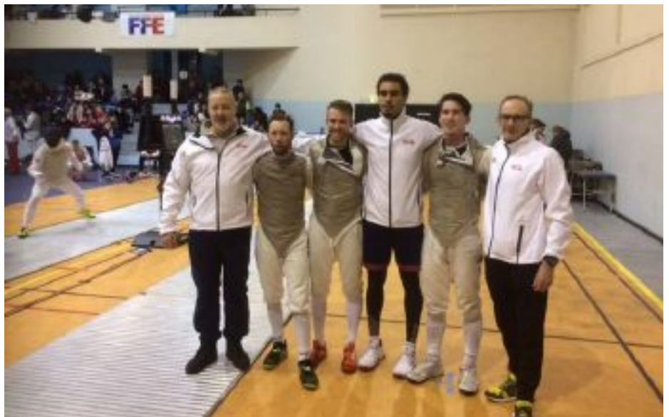
With the team

As Alexander Suvorov said "Train hard, fight easy".