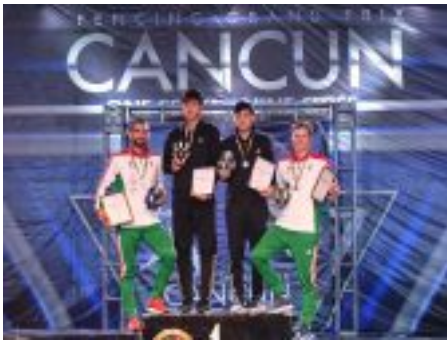
Cancun GP 2017 Men's Podium