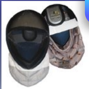
Absolute foil electric mask