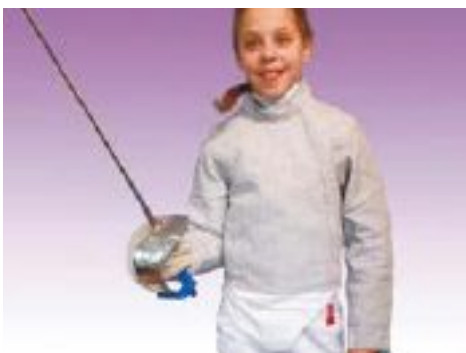
Sabre Lamé £68.99