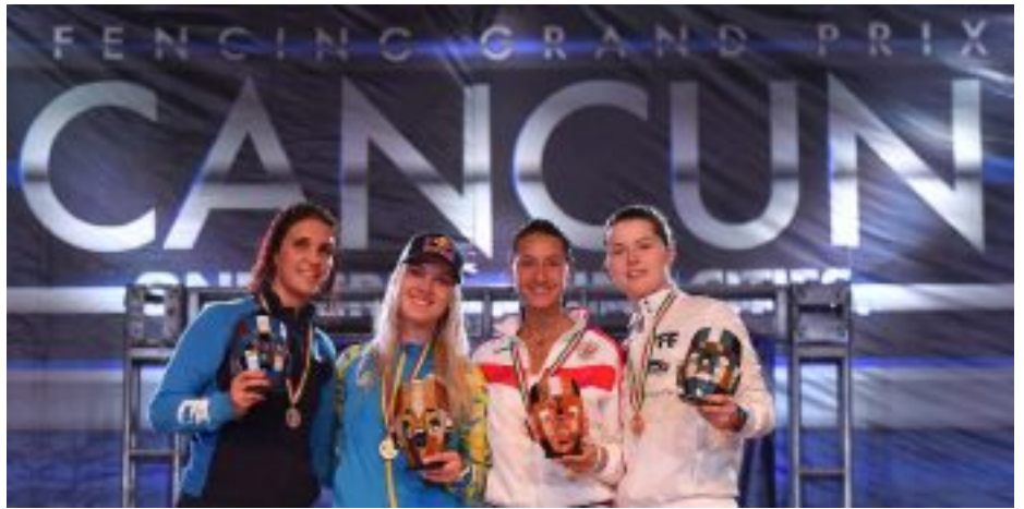
Cancun GP 2017 Women's Podium